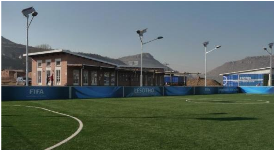
Above: The centre building and Astroturf pitch Below: An exhibition match at the opening ceremony

Based in the heart of Maseru, Lesotho's capital city, the tour group will deliver activities at the center, see Kick4Life activities in action and play on the pitches.