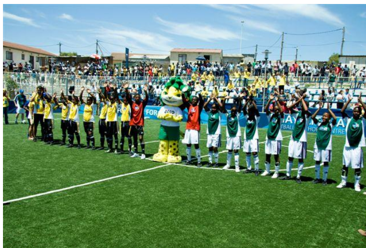
The first centre that is already running in South Africa

The centre will also provide a focus for the tour. You will have the chance to play football here, deliver HIV education and see how the 2010 World Cup is having a lasting legacy for the people of southern Africa. We are also aiming to develop an accommodation block that in future will provide first class accommodation for people attending our tours.